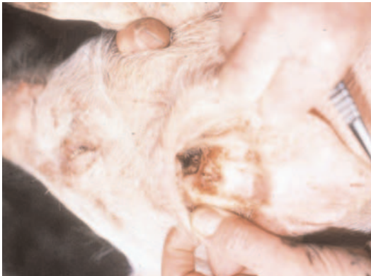
Fig. 3: Active infection in the ear of a pig.