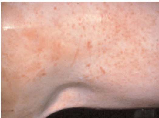
Fig. 4: Hypersensitive reaction to mange mites in a growing pig.