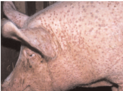
Fig. 1: Severe hypersensitive (allergic) mange in a sow.

The allergic form of mange is seen in older pigs and adults and probably represents re-infestation of a sensitive individual. Huge numbers of small round red pimples occur over the whole body and can take several weeks to disappear following treatment.