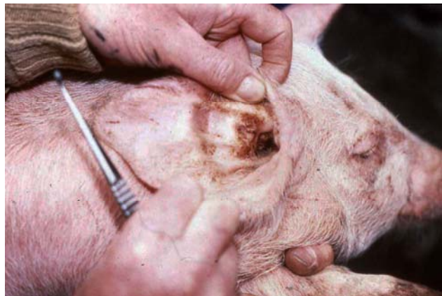
Fig 3: Active infection in the ear of a pig