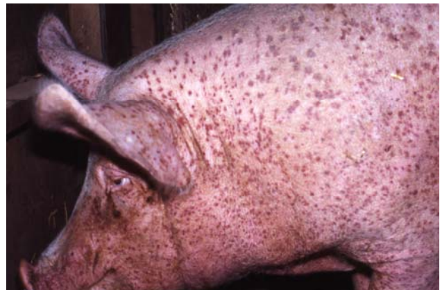
Fig 2: Severe hypersensitive (allergic) mange in a sow