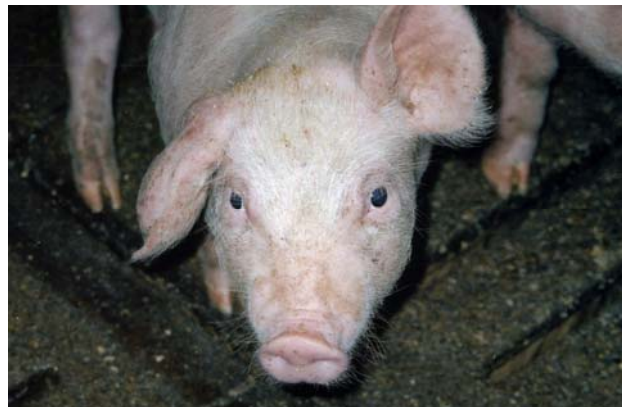
Fig 6: Aural haematoma in a young growing pig - a common sequel to mange infestation and head shaking

in the breeding herd and that 'all in all out' pig flow into clean accommodation is practised, there is often no need to treat growing pigs. Where these criteria are not followed, in-feed treatment soon after weaning is effective – usually given in the second diet – 1 week after weaning for 7 days. Treatment in the first week after weaning is difficult due to low feed intake. Thereafter, pigs must not mix with older animals or enter dirty pens. Attention is particularly necessary in hospital areas which are frequently permanently occupied, rarely de-populated and cleaned, contain mixed ages of animals and contain compromised animals that are particularly vulnerable to parasites.