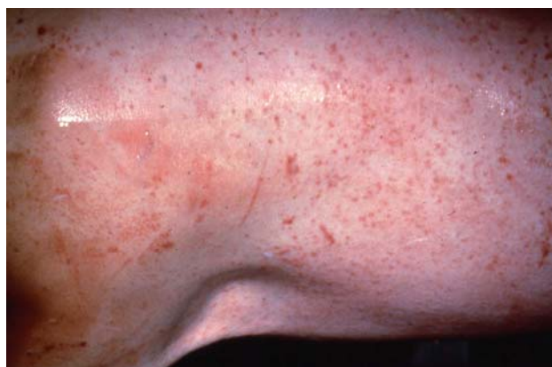
Fig 5: Hypersensitive reaction to mange mites in a growing pig