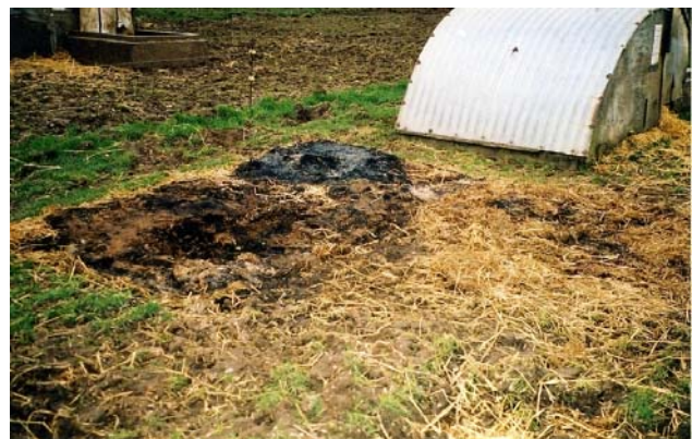
Fig 5: Burning of old beds outdoors is considered an effective hygiene measure but environmental restrictions should be considered

cleaning is difficult (solid, cracked concrete, moulded plastic slats).