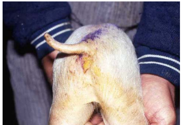
Fig 3: Piglet with typical coccidial perineal staining