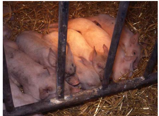
Fig 2: Loss of condition in pigs affected with coccidiosis