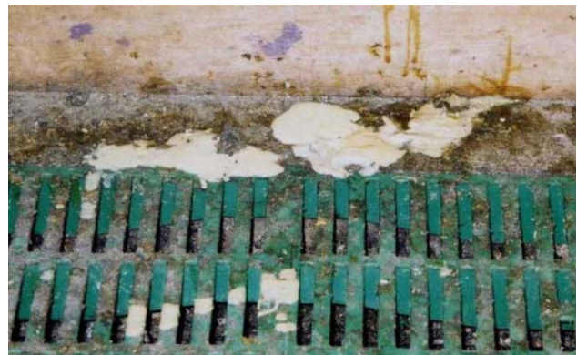
Fig 1: Typical creamy coccidial scour