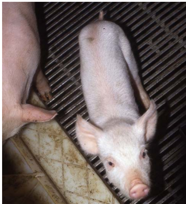
Fig 4: Fading post weaning can be due to sub-clinical coccidiosis

Whilst scour typical of coccidiosis is not seen after weaning, there is growing evidence that, separate to the effect of the disease on weaning weights and subsequent performance, sub clinical coccidiosis does occur after weaning and can be responsible for post-weaning fading (fig 4). This condition can occur independent of clinical disease before weaning, although investigations suggest that where post