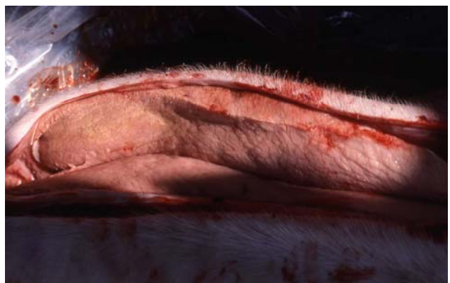
Fig 2: Acute Porcine Stress Syndrome can be mitigated by raising anti-oxidant provision; note here the 'just cooked' appearance of affected muscle.